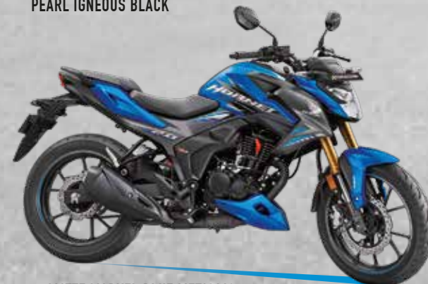
MATTE MARVEL BLUE METALLIC